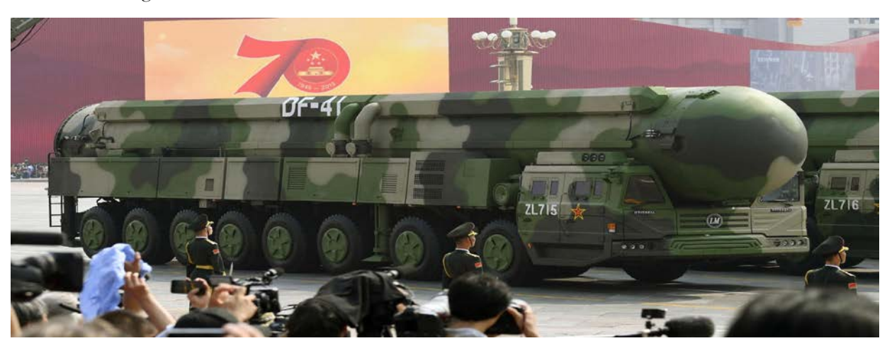
Figure 4: The DF-41 on display at the 70th Anniversary parade

The parade concluded with the DF-41 Intercontinental Ballistic Missile (ICBM). The DF-41 is the most advanced of the DF series and is a road mobile, ICBM capable of carrying multiple independently targetable re-entry vehicles. Its road mobile capability is especially important, offering a high degree of survivability during conflict and also offers more flexibility to respond to fast moving perceived threats as required. According to coverage of the parade from The Diplomat , "The DF-41 is expected to become the cornerstone of China's strategic deterrence." <sup>30</sup>