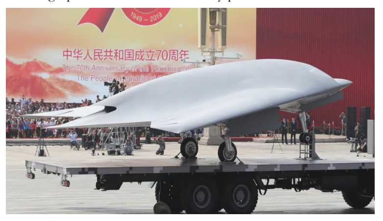
Figure 6: The new configuration of the Sharp Sword stealthy UAV

Assessments of the version on display also indicated that it was actually a model of a still developing variant as it lacked several features expected to be on a flying aircraft. Nonetheless, the display of the GJ-11 during China's most high-profile and watched military parade does indicate the continuing prioritization of the development