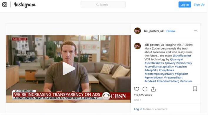
Figure 1: In June 2019, a deepfake of Facebook CEO Mark Zuckerberg talking to CBS News about "the truth of Facebook and who really owns the future" was put on Instagram. The video is of reasonable quality, though the message the fake Zuckerberg delivers is clearly a tongue in cheek effort to draw attention to the increasingly urgent challenges for Facebook in particular of monitoring content and balancing content flows in the information age. Nonetheless, the footage along with deepfake footage of former President Obama delivering speeches he never gave and other examples of deepfake technology should catalyze defence and security communities of all sizes to begin to contemplate the detection and defeat of deepfakes

More worryingly, the study also found a difference in the sophistication of the activity between 2016 and 2018—by 2018, "bots better aligned with humans' activity trends, suggesting the hypothesis that some bots have growing more sophisticated." Bots also did less retweeting, reflecting a trend among human users of Twitter