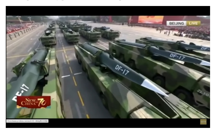
Figure 3: The DF-17 on display during the 70th Anniversary of the founding of the PRC on 30 September 2019.

The introduction of the DF-17 hypersonic glide vehicle, which was paraded carrying a ballistic missile, stood out as particularly provocative and impressive and indicates the continued global progress on hypersonic