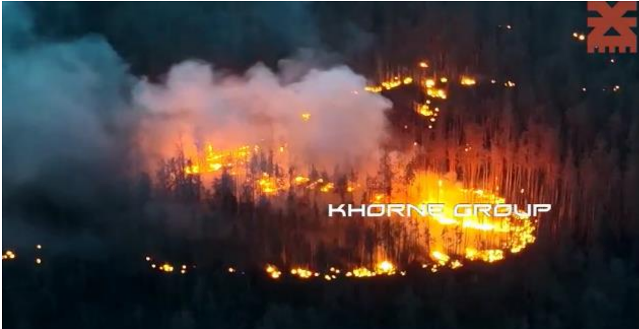
Figure 3: A screenshot from a video posted on social media reportedly showing the impact of a “dragon drone” attack outside of Kharkiv.

In addition, roughly a week after the CNN reporting on Ukraine’s use of thermite spewing drones, a video of Russian thermite drones also surfaced . The Russian video show less damage but reinforce the adaptive and frequently escalatory dynamic that has marked the drone war in Ukraine.