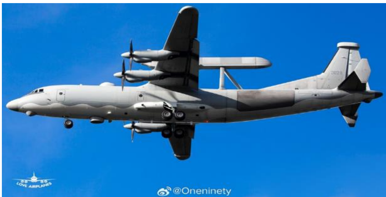
Figure 6: The Y-9LG electronic warfare aircraft in action during Exercise Falcon Strike in Thailand in late August.

The Y-9LG is designed to operate from a standoff position, leveraging its powerful radar to electronic attack against adversary communications systems or detect signals and collect data in the electromagnetic spectrum that could help either kinetic or non-kinetic targeting. The War Zone points out, though, that there are concerns about the survivability of platforms like the Y-9LG in a high-intensity conflict against a peer adversary. The sensors require a line of sight to the targeted emitter to perform their functions, potentially placing them in a detectable range.