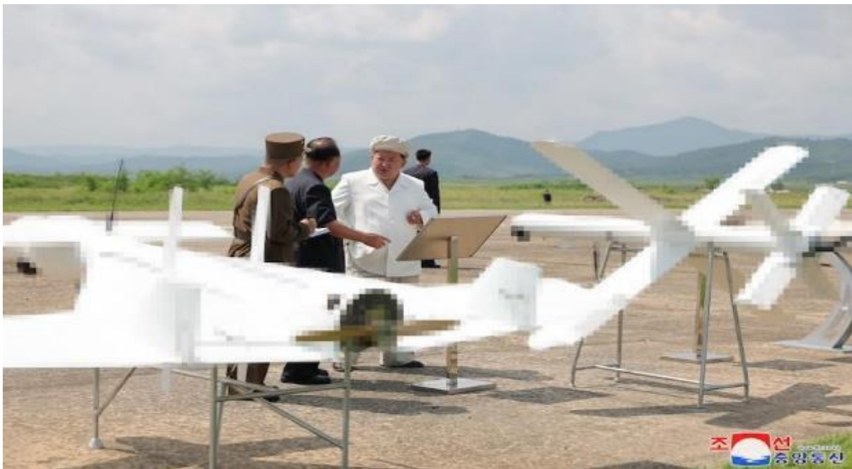
Figure 4: North Korean state media organization KCNA released the above photograph of Kim Jung Un inspecting two loitering munitions.

North Korea’s development of loitering munitions makes sense for a country seeking lower-costs options for increasing its capacity to attack enemy forces both along the front lines or deeper behind a conflict zone. Harop drones were originally designed for anti-radar mission, though they have been deployed against artillery pieces and other forces. State media reported that the cross-wing system successfully destroyed a mock South Korean main battle tank.