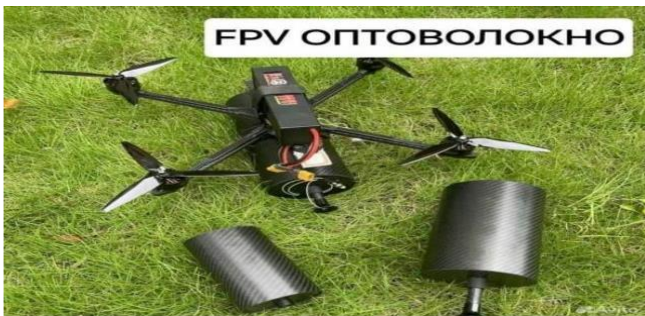
Figure 2: A photo of the Vandal Prince of Novgorod drone that uses a fibre optic cable to ensure secure communications.

While Russian sources originally claimed the capability was indigenously developed, additional unverified reporting from independent observers and bloggers focused on the conflict in Ukraine has emerged that claim the drones are actually imported Chinese Skywalker commercial drones known for their fibre optic cables.