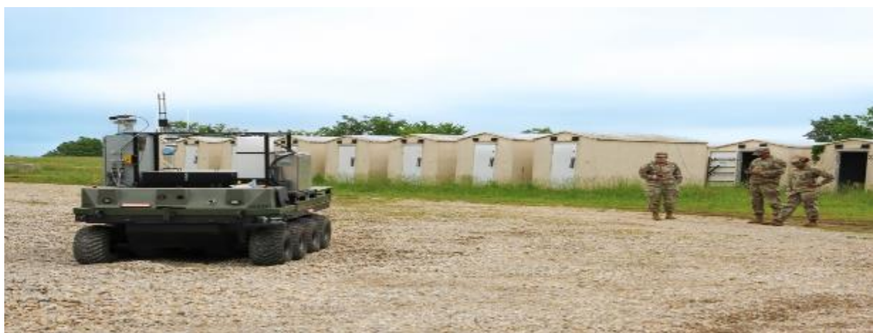
Figure 5: The Autonomous Equipment Decontamination System being tested in May.