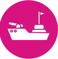
SEE UND FLUSS