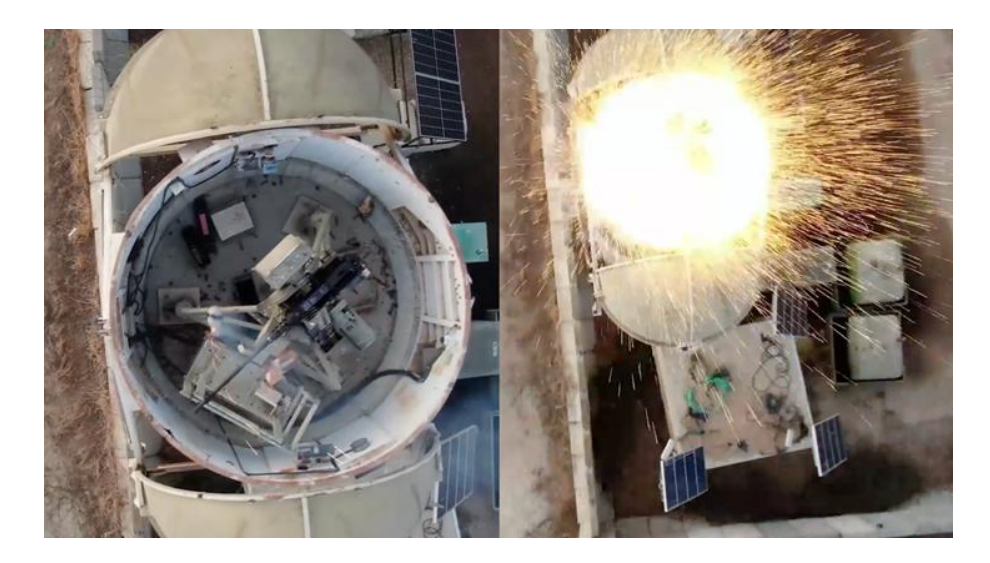
Figure 5 - Footage from Drone Attacks on Israeli Border Fence on October 7, 2023

"The attack on October 7 is unprecedented from Hamas both in scale and sophistication, displaying characteristics of a special-forces operation that employed small units with bespoke training, equipment, and tactics to achieve outsized strategic results [7]. On that day, over 1,000 Hamas fighters entered southern Israel through nearly 30 breach points in the country's border wall with Gaza. The 40-mile-long barrier, which cost over $1 billion and was upgraded in 2021, was designed to prevent infiltration with a variety of surveillance and defense technologies. These include cameras, radars, and other technological sensors, as well as barbed wire and an underground concrete barrier to prevent tunneling. In addition to the 20-foot-tall fence, observation towers with remote machine gun turrets were positioned, in some areas, every 500 feet along the border.