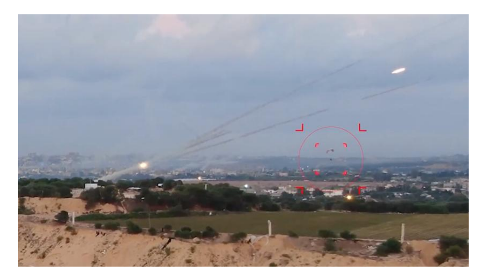
Figure 6 - Footage of a Hamas Fighter Using a Paraglider during the October 7 Attack

Simultaneously, some of the fighters flew on motor-powered paragliders across the border fence into Israeli territory. Although slow and loud, the gliders had to cover only a short distance. A video of the attack shows that some motor-paragliders crossed the border under the cover of rocket barrages. (Figure 6)