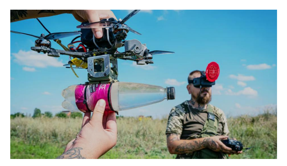
Figure 8 - Mission-Critical? Source: The Economist, Sep. 21<sup>st</sup> 2023

This principle remains steadfast today; however, the battleground has morphed into a sophisticated network of interoperable Mission-Critical systems, now infused with Artificial Intelligence, sourced from diverse vendors. The maintenance of these systems, crucial for success in defence and aerospace, poses unprecedented challenges with the threat's evolution.