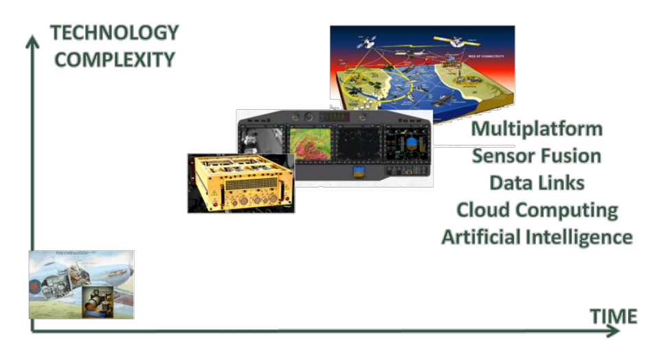
Figure 2 - From WW2 up to modern warfare systems

Several methods were used for data intelligence to construct a mental representation of the opposed forces. The air-reconnaissance was one of them. At that time, the difficulty was to interpret the information, with a different meaning of real-time than nowadays concept. With the rather long inertia of troop's movements, the validity of one single observation allowed combination from other sources to shape the picture of the opponent's strategy.