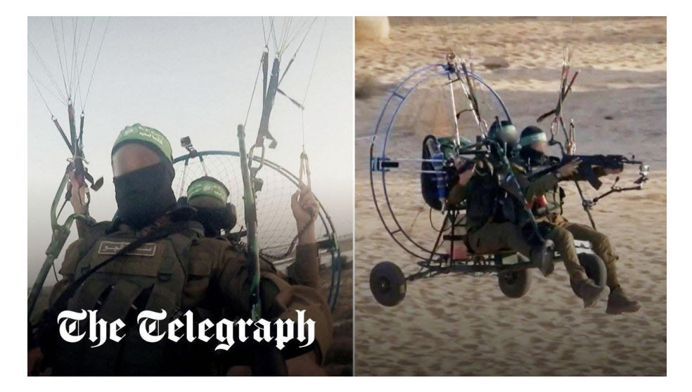
Figure 7 - Armed paragliders

Since taking control over the Gaza Strip, fewer suicide attacks were conducted, stymied in part by Israeli border security measures, instead expanding its rocket and drone capabilities." [8]