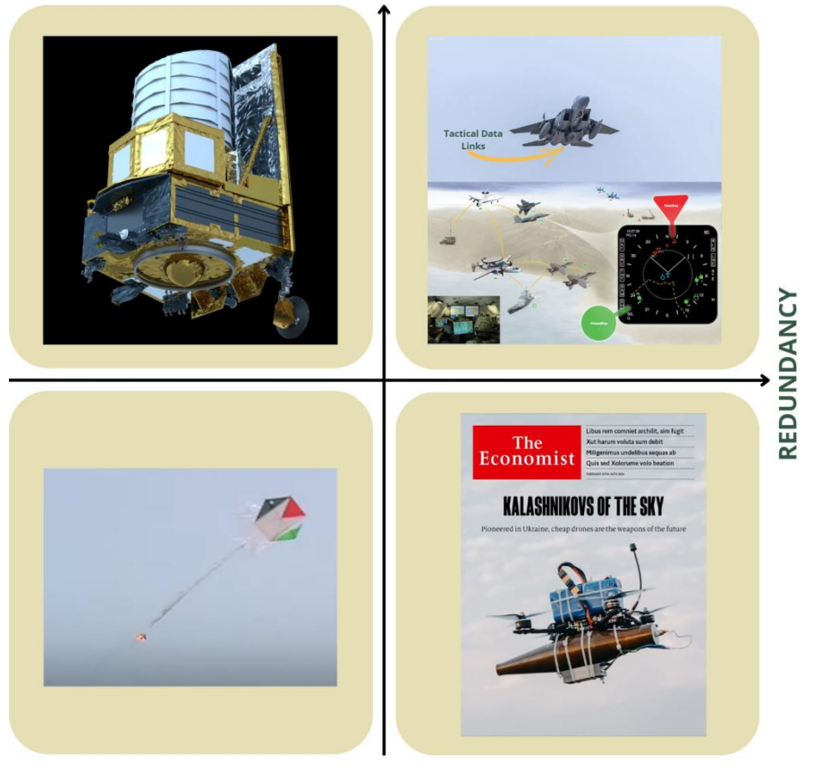
Figure 4 - Plot of mission-critical systems

A low complexity, highly redundant example is brought by the massive introduction of low-cost quadcopters. The title of the picture doesn't require any additional comment.